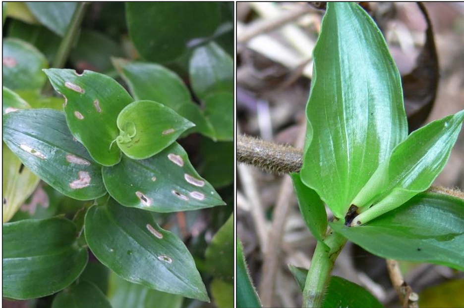
Figure 6 Neolema abbreviata adult feeding damage (left image, holes in leaves), and larval feeding damage (right image) showing dead stem tip where the larva has burrowed into the meristem.