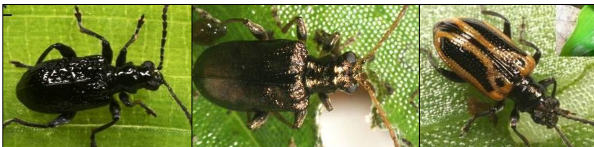
Figure 1. Biocontrol beetles: L–R: stem Lema basicostata , leaf Neolema ogloblini , tip Neolema abbreviata .