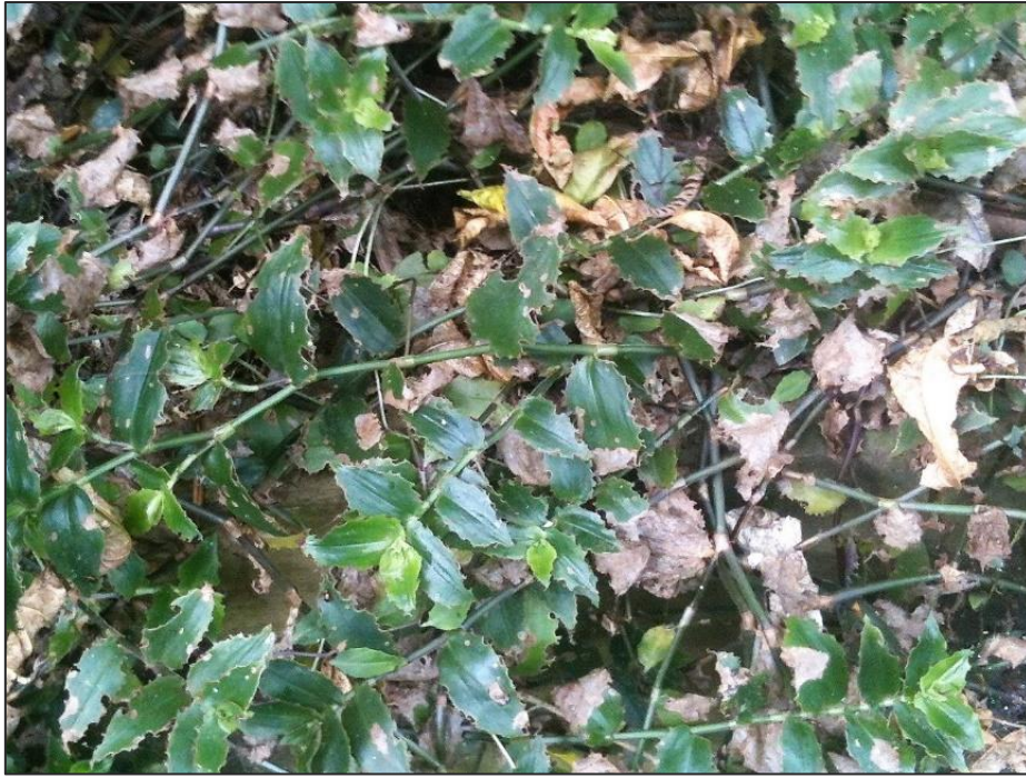
Figure 5. Neolema ogloblini adult feeding (ragged leaf edges) and larval damage (brown windowed leaves).