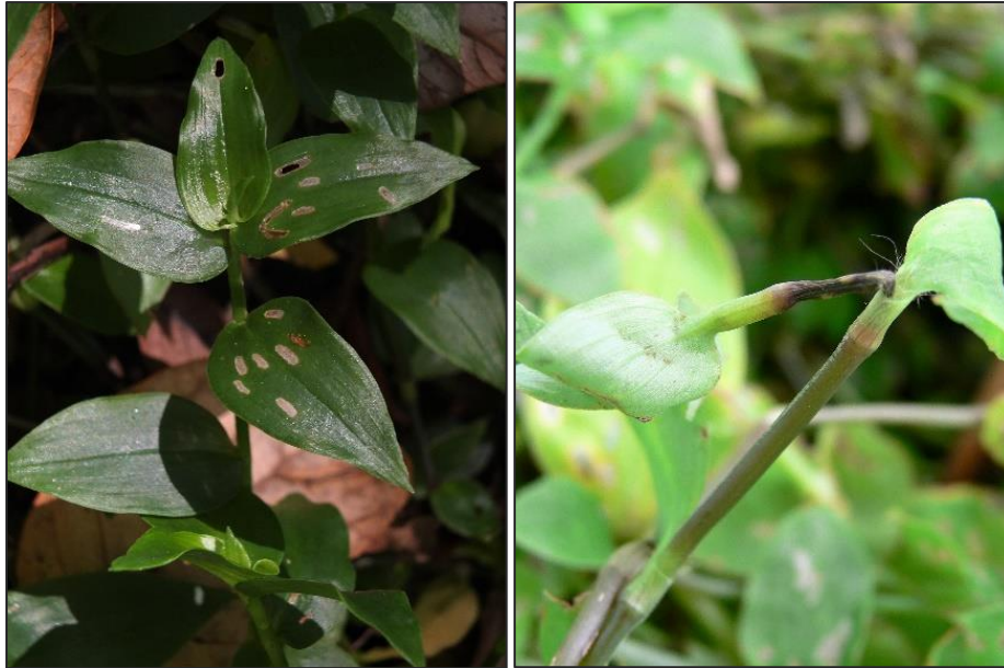
Figure 7. Lema basicostata adult feeding (left image) and larval feeding damage causing stem to collapse (right image).