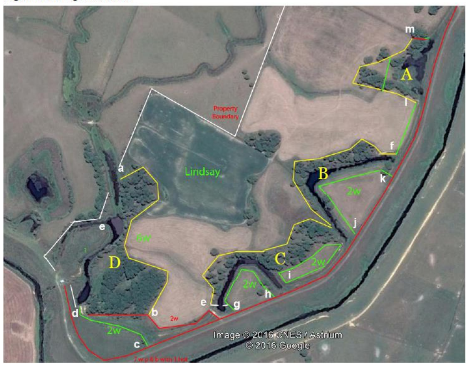
Figure 1: management areas

A&E Lindsay dairy farm runoff, Hikurangi/Wairua. One of three farms in the area where QEII Covenants have been established based on LW's Biodiversity Assessment on Farms initiative.