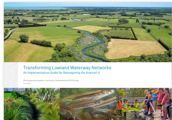
Implementation Guide (IG): (84 pages)