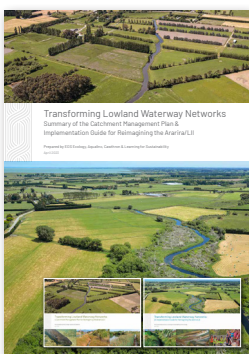
CMP/IG Summary: Summary of CMP & IG documents. (28 pages)