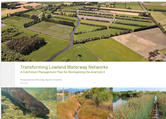
Catchment Management Plan (CMP): (106 pages)

Overview of available project documentation, see online by clicking here , or using the QR code.