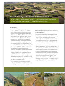
Project Briefing Flyer: Introduction to CMP & IG documents. (2 pages)