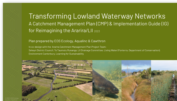
Powerpoint Presentation: Summarises main topics of the CMP & IG documents. (51 pages)