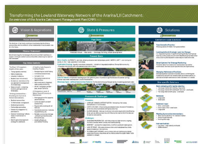
CMP Diagram: Summarises the sections of the CMP document – the content specific to the Ararira catchment. (1 page – available in A4/A3/A1 versions)