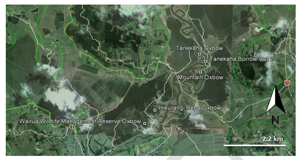
Figure 4. Recommended oxbow lake monitoring sites in the Hikurangi Catchment.