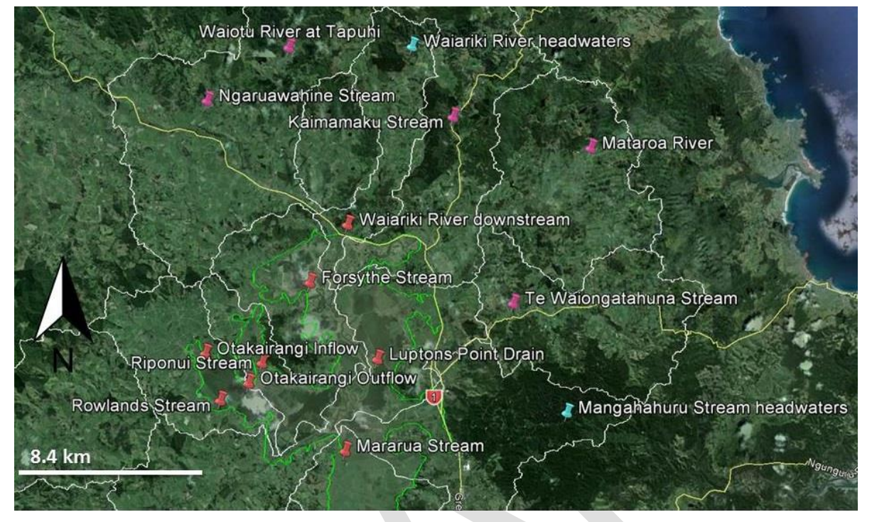
Figure 2. Recommended stream monitoring sites within the Hikurangi Catchment (HC). Red pins = sites within the HC floodplain, purple pins = sites in the upper catchment, and blue pins = potential control sites. Border of the HC floodplain shown in green.

These stream surveys should be carried out at least once and ideally repeated at least every 5 years to obtain a broad picture of the state of freshwater ecosystem health in the HC and catchment.