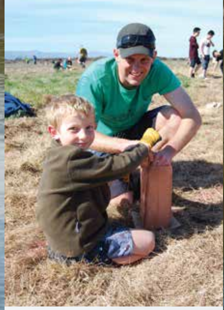
Canterbury Plant-Out Day at Yarrs Flat organised by Te Ara Kākāriki and supported by Living Water, Selwyn District Council, Environment Canterbury, The Canterbury Community Trust, The Isaac Conservation and Wildlife Trust, Te Rūnanga o Ngāi Tahu and Waihora Ellesmere Trust.