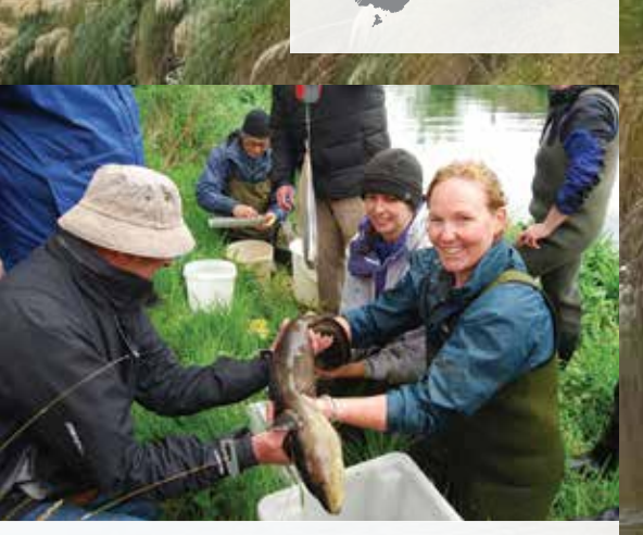
Long-finned eel being measured in Ararira-LII River fish survey organised by DOC national freshwater team.

We are focusing on opportunities to demonstrate healthy waterway management and to engage the local rural and urban community with their natural environment, including the restoration efforts of key wetland areas at Yarrs Flat Wildlife Reserve and Yarrs Lagoon.