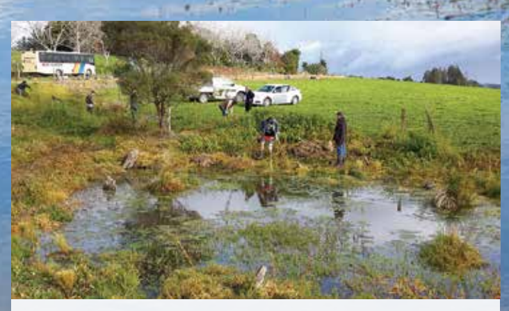
Planting of a constructed wetland on Steve Browns farm with Kamo High School, DOC, Fonterra and local community. This wetland was constructed as part of a wetland construction workshop supported by Living Water in 2014.

Our focus is on opportunities to protect remnant wetlands within the Hikurangi floodplain. We want to join together wetland remnants to enhance ecosystem health within and beyond the flood plain. We aim to develop new knowledge on flood, sediment and nutrient control to benefit farmers and other groups.