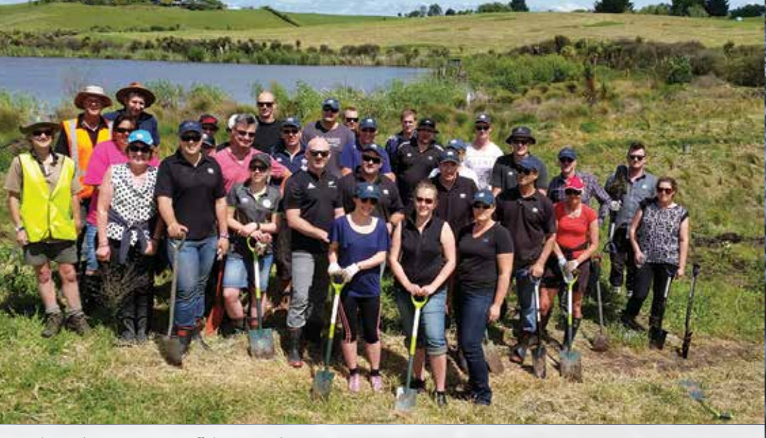
Hamilton and Te Rapa Fonterra staff planting at Lake Areare.

Our focus is on restoration and habitat enhancement along lake margins and drains, and working with farmers around the three lakes to support the adoption of best farm management practices.